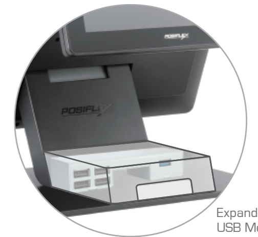
Expandable USB Module

Advanced cable management design delivers a truly clutter-free station. The standard base can house the optional Powered USB or USB extension module, while the optional base integrates a UPS backup (RB-5000) for the event of a power failure.