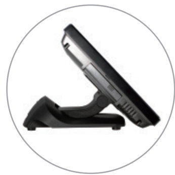
Low Profile Mode