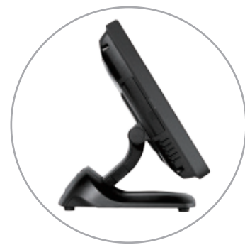
Full Extended Mode

The XT-6315 provides the selection of two foldable bases, the curvy slim GEN7E base and the larger but practical GEN8E base. The foldable base can be configured into "Flat Folded Mode" to save the shipping package volume, "Low Profile Mode" to allow greater interaction between the cashier and the customer, and the traditional "Full Extended Mode". All this can be achieved with a simple pull of the hidden lever.