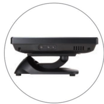
Flat Folded Mode