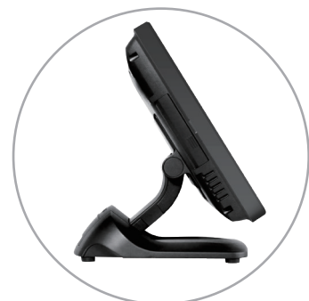
Full Extended Mode

The XT-3815 provides the selection of two foldable bases, the curvy slim GEN7E base and the larger but practical GEN8E base. The foldable base can be configured into "Flat Folded Mode" to save the shipping package volume, "Low Profile Mode" to allow greater interaction between the cashier and the customer, and the traditional "Full Extended Mode". All this can be achieved with a simple pull of the hidden lever.