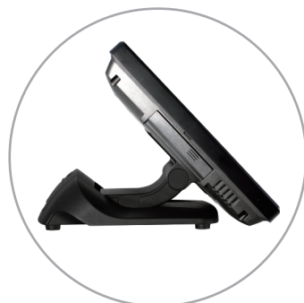
Low Profile Mode