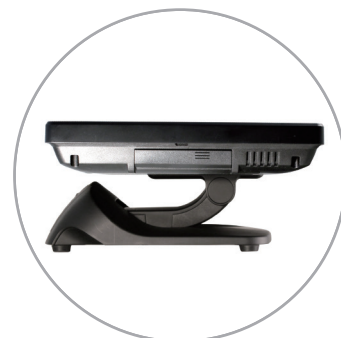
Flat Folded Mode