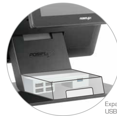
Expandable USB Module

A unique cabling system (I/O expansion are centralized and hidden in the rear cover) delivers a truly clutter-free station. The standard base can house the optional PoweredUSB or USB extension module, while retaining the sleek look.